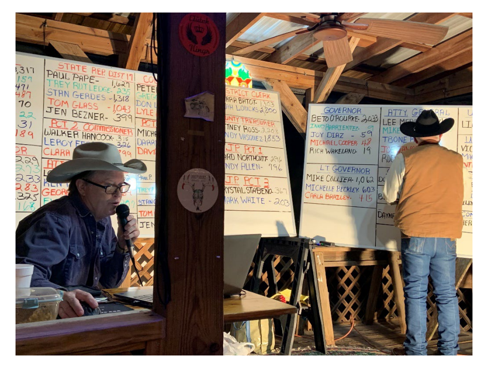
Primary Election Night – Bastrop Style General Turn Out 12,861 (24%) of 53,407 Democratic Ballots Cast – 3,706 Republican Ballots Cast – 9,155